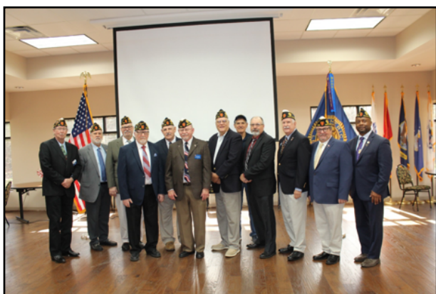
Post 555 Legionnaires that supported and conducted the 23rd District Oratorical Program

The 23rd District winners also won the 2nd Division Oratorical Contest on February 15th and will go on to compete in the Department of Alabama Oratorical finals. The Department finals will be held Saturday, 14 March 2020, at the Alabama Department of Archives and History, 624 Washington Ave Montgomery, AL 36130, 10 am sharp. All post members, family, and friends are invited to attend.