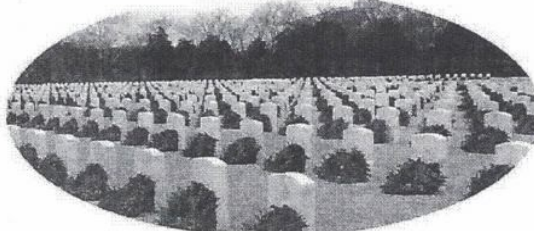
Remember - Honor - Teach Updated 18 Jan 2020

The Blue Star Salute Foundation, Inc., (BSSF) needs sponsors for our 12th Annual Wreaths Across America project -- a nationwide fundraising endeavor to provide a live Maine Balsam Wreath for each Veteran's grave each Christmas season. Wreaths sponsored by this BSSF endeavor are for Veterans graves in the Alabama National Cemetery (ALNC) , located on HWY 119 in Montevallo . The 2020 Remembrance Ceremony will be held at 11AM on December 19, 2020. The cost to sponsor a wreath is $15.00 . In 2020, we will need approximately 7,500-8,000 wreaths for our Cemetery. All wreath sponsors as well as family members of those buried within ALNC are invited and strongly encouraged to attend and participate in the wreath-laying ceremony.